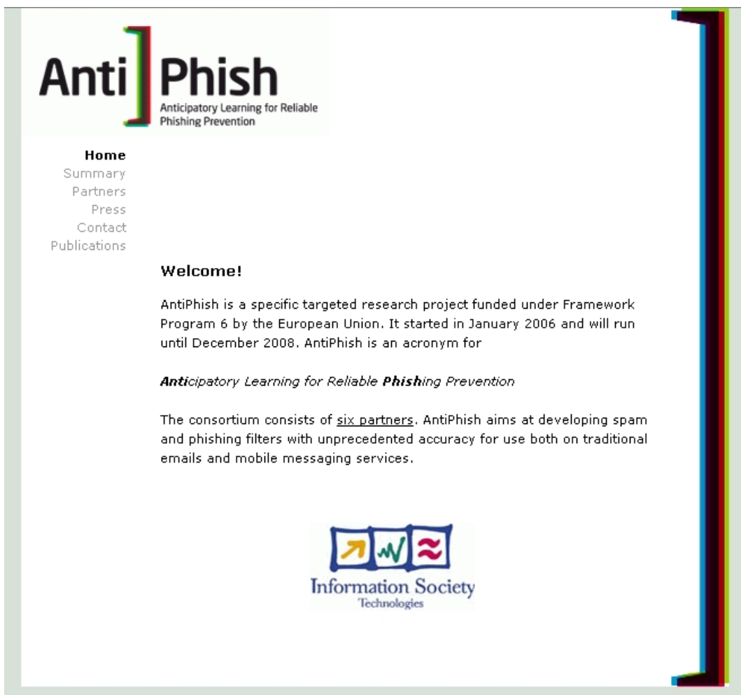
Figure 1: Home page of the website with navigation.

Publications: Contains a list of scientific publications by consortium members which are linked to AntiPhish. In addition public deliverables will be compiled here.